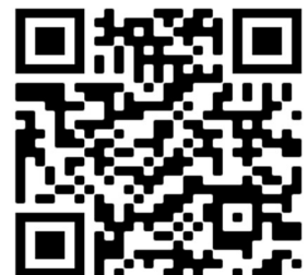
Stories of Resilience online

To help us keep control costs and keep you informed about the latest here at St. Louis Center, please share your email address with us today . Email us at SLCdev@stlouiscenter.org or include it on the donation form below. It is a small step that can have a big impact.