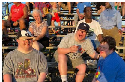
Residents of St. Joseph Hall had a great time watching the Demolition Derby.

Several of the St. Louis Center residents went to the Chelsea Fair with staff members on Wednesday, August 18th. They purchased dinner from the fair concession stands and ate under the pavillion.