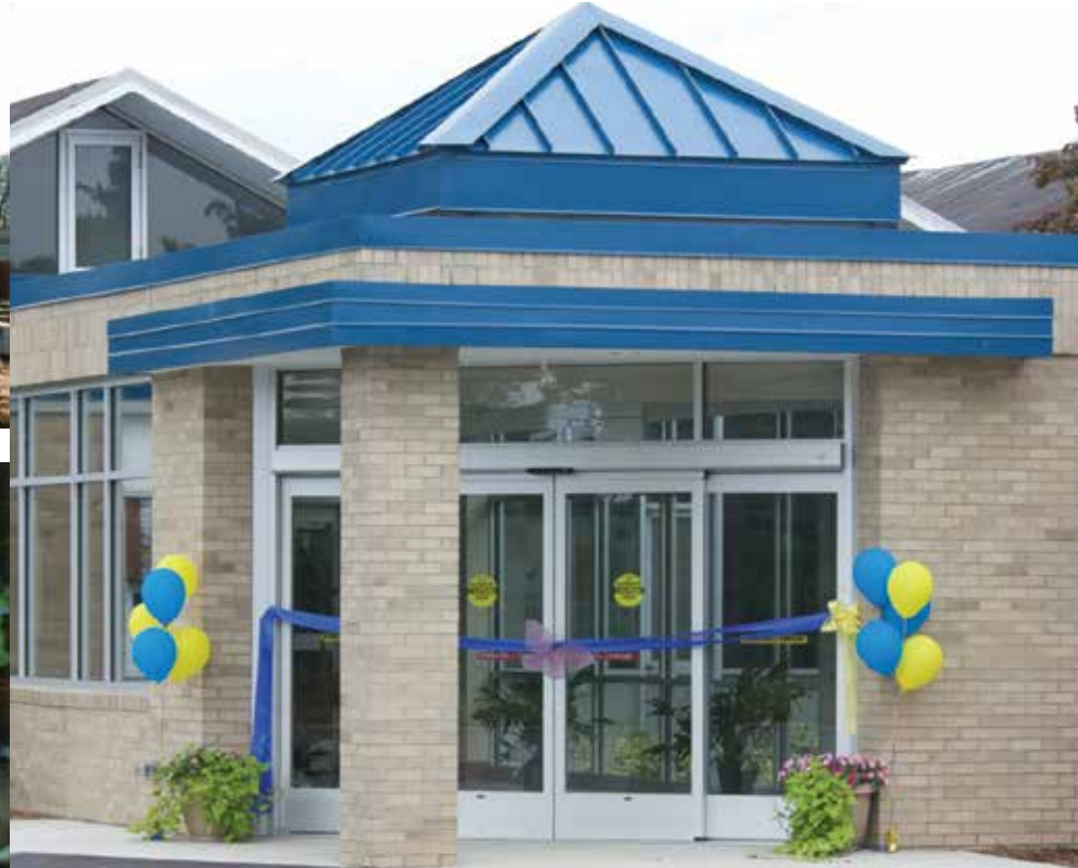
In 2010, SLC celebrated its 50th Anniversary, and decided to expand facilities once again. A new Development Director was hired, and the Legacy Campaign Committee was formed. A ribbon cutting was held in 2011 for the new Family Welcome and Orientation Center at the main entrance.