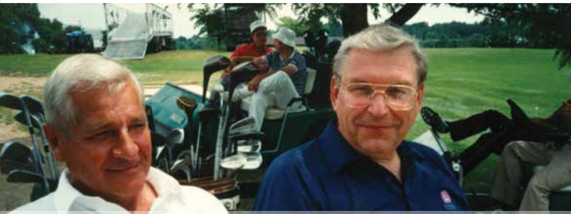
In the 1990s, SLC began more community outreach to raise funds to support the needs of the residents. This was the start of the Golf and Glory Outing, the IACL Dinners, the Dad & Lad Golf Outing along with many civic and religious groups holding summer BBQs and Christmas parties for the residents.